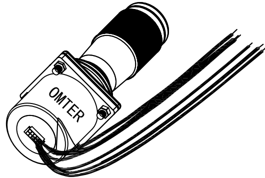
俯视图 Vertical view